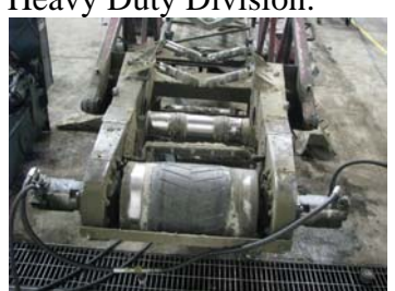
Working on a conveyor for one of our customers.